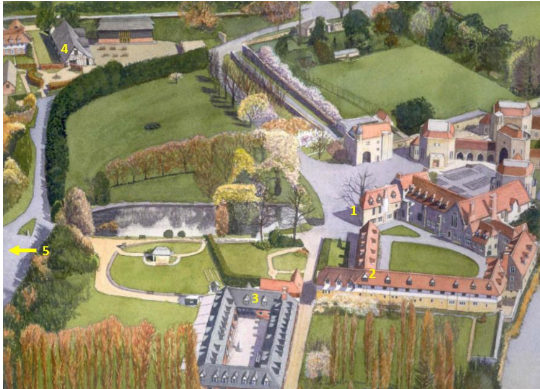
1 Reception 2 Old Block Rooms 3 New Block Rooms 4 Coffee Shop 5 Camping Field

Up until 2019 this has not been a problem, however demand has been increasing. If a problem exists, advice will be given by email by 1 st July, otherwise your booking is OK.